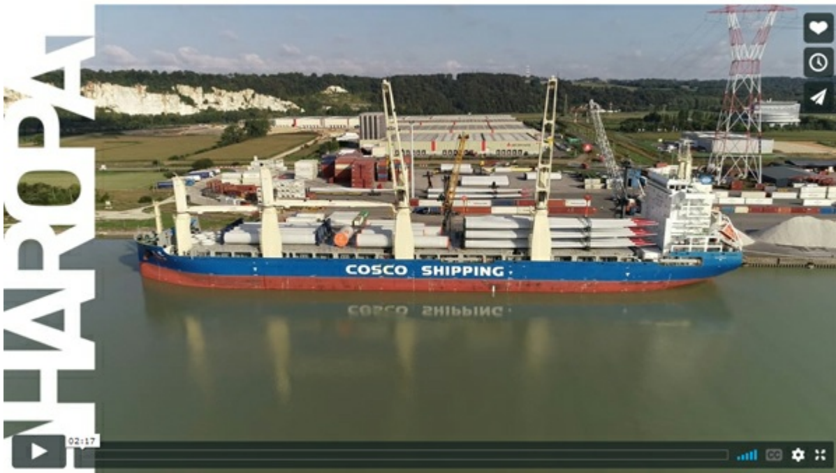
Route de l'artique

Retrouvez la route de l'artique en vidéo !