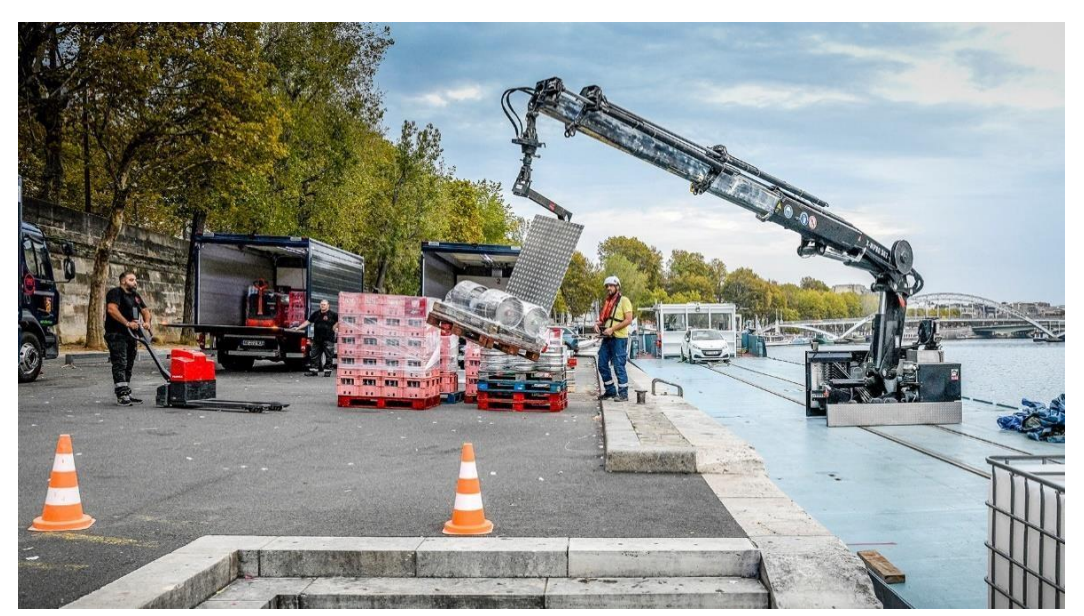
CAPTION: ZULU03's crane in the process of unloading the goods to be placed on to the trucks for the second delivery round. The returnable packaging has been unloaded from the trucks and is waiting to be transferred to the ZULU03, which will then leave on the river for the storage facilities.

Since June 2023, OBD Grand Paris and Sogestran Logistics have been operating a new logistics solution to allow beverages delivery vehicle reloading right in the heart of the nation's capital