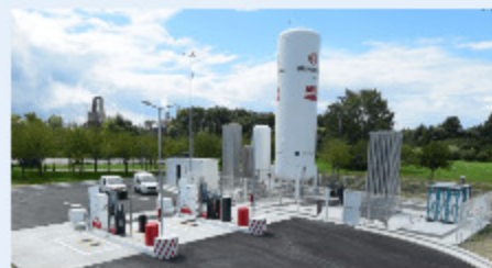
Click to locate the PRIMAGAZ NGV station